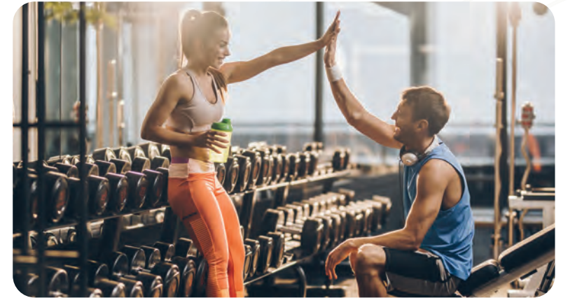
Gyms, outdoor wellness and fitness areas