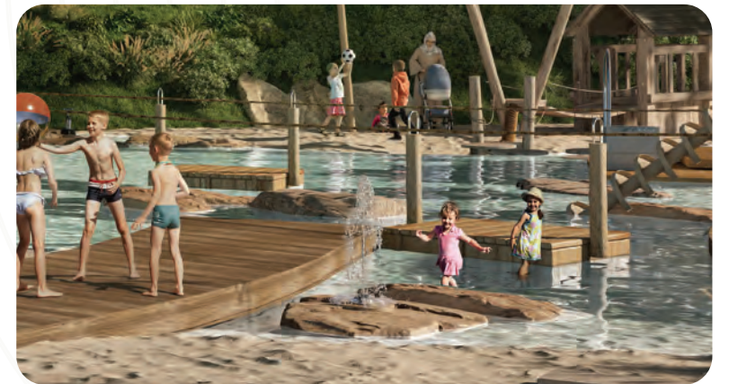
Swimming pools, splash pads and kids' play areas